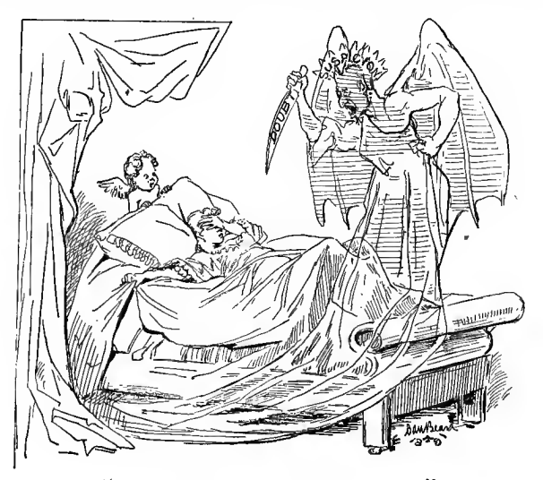
"THE SHADY DEVIL HAD KNIFED HER,"

right place, to save the poor unstable young man from changing his political complexion once more. He had been on the point of beginning to totter again, but this prop shored him up and kept him from floundering back into democracy and re-renouncing aristocracy. So he went home glad that he had asked the fortunate question. The girl would accept a little thing like a